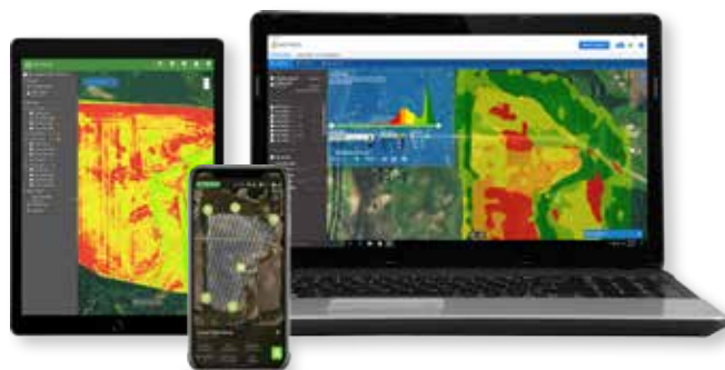
FieldAgent Web, Mobile, and Desktop

Our FieldAgent Platform is a complete agricultural data analytics solution that's with you wherever you are — in the office or in the field. Coupled with a Sentera precision ag sensor, FieldAgent takes you beyond aerial photography into meaningful data products with actual economic value, such as NDVI and NDRE zone analysis, population analysis, weed mapping, and elevation mapping.