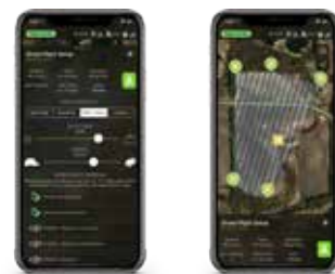
FieldAgent Mobile iOS